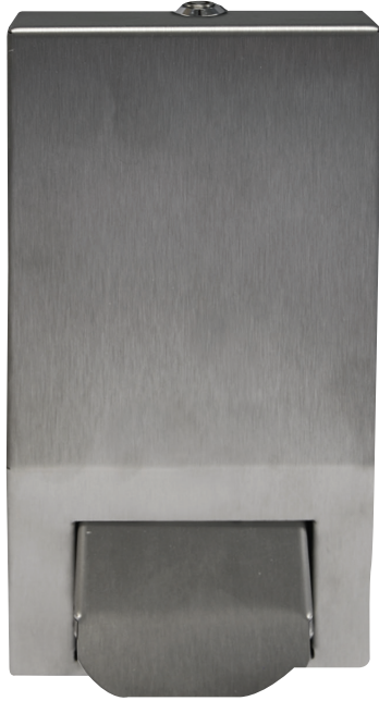
98123 No Sight Window