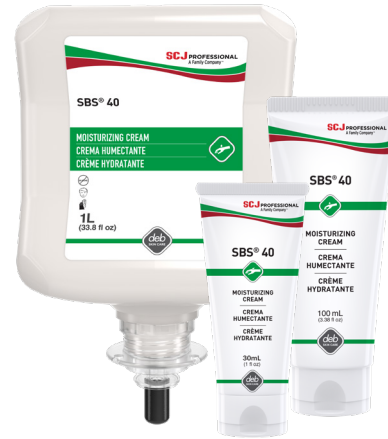
Application - Normal to dry skin

After-work skin restore creams help to maintain the skin in healthy condition by keeping it strong and supple, avoiding dryness. Using restore creams is an important element in skin care best practice.