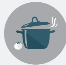
6. Before preparing food