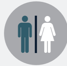
2. Using the toilet