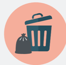
8. After handling and disposal of refuse