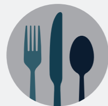
3. Before eating food, especially with fingers