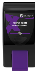
Cleanse Heavy GFX